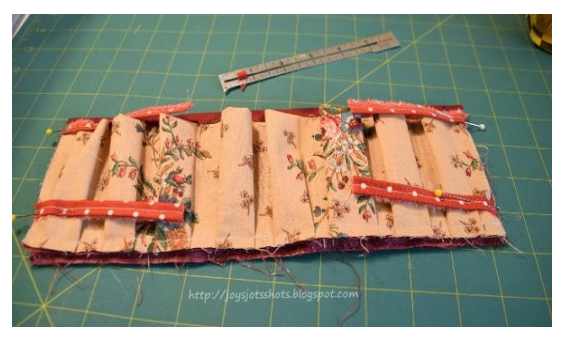
Pin ties in place.