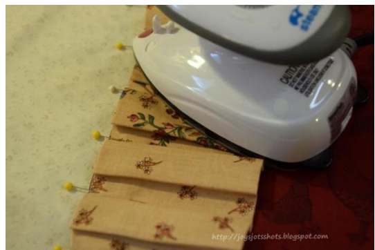
Either make tucks or pleat the extra fabric in between pins & press.