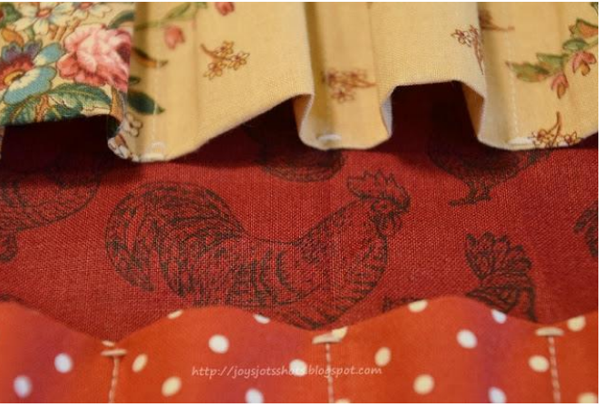
Stitch each crease line starting at raw edge & ending about 1/8 inch from fold with a zig-zag stitch set at 5.0 width and 0 length.