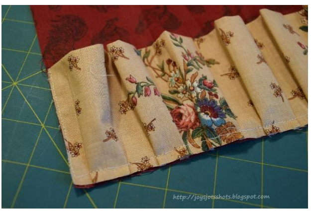
Stitch around raw edge of pocket. At this time, I stitched on all edges, so as to hold fabric stable for future stitching.