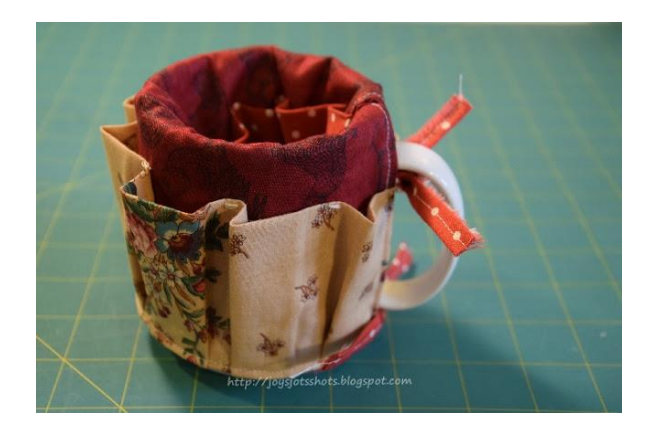
Wa La! No bias binding needed!

Turn right side out, fold in opening to equal the seam, then top stitch all around to close in the opening which will be inside the cup and won't be seen anyway. I used my Edge stitching or Joining foot with my needle in left position to help my top stitching be a bit more accurate.