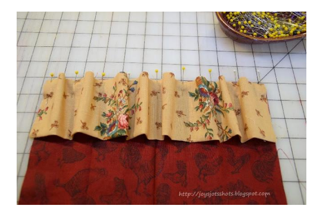
With raw edges meeting, match the crease lines and pin. Pin the edges together.