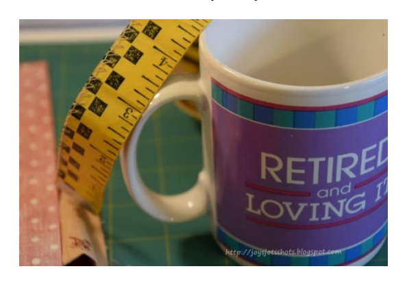
Measure distance from top of mug to top of handle