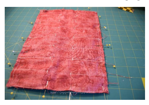
Pin the facing right sides together.