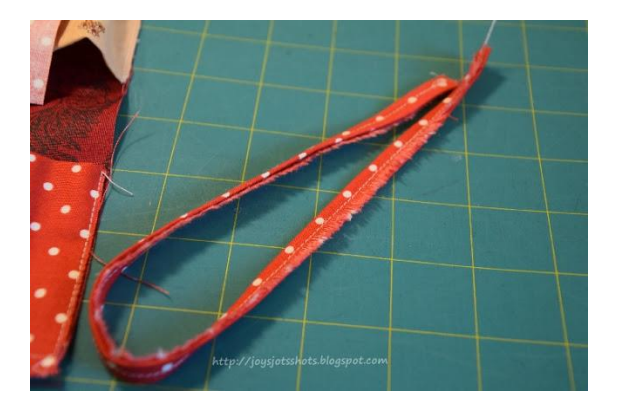
To make the ties you could use ribbon or fabric.

Make the ties whatever way suits you, but make them very narrow. My piece of fabric is one inch wide so I fold in about 3/8 in. then folded over the soft selvage edge 3/8 over that. I let the fabric speak to me and it wanted the soft selvage to be seen.