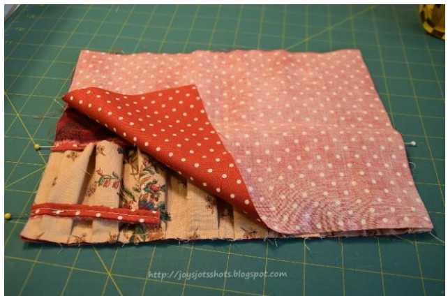
Lay the piece flat.